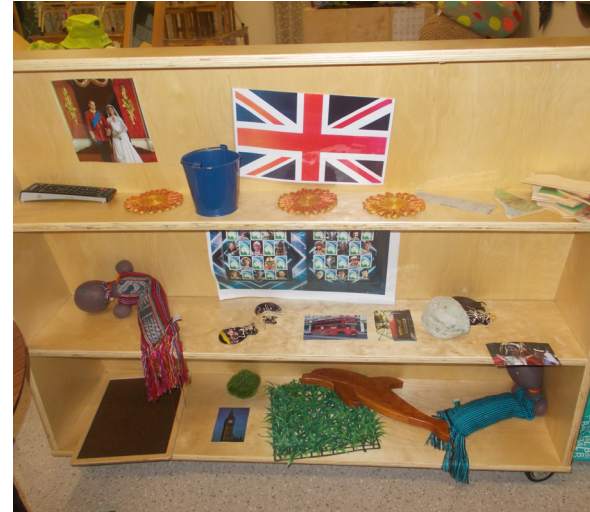
Harmony Day: Exploring all of our different cultures