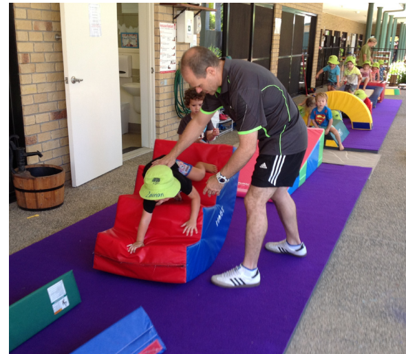
Gymfinity: Tumbling through the obstacle course

Each time the children gained more confidence and explored boundaries as they worked on developing gross motor skills. The children all had a wonderful time and were very polite and used their best manners to thank the instructor.