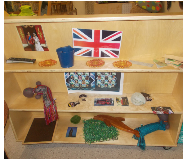
Harmony Day: Exploring all of our different cultures